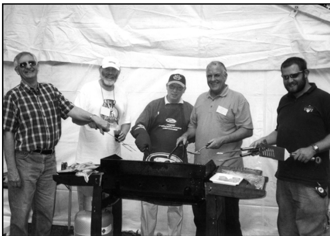
"Too many cooks?" The boys around the barbecue at the April Picnic at Botanic Park.