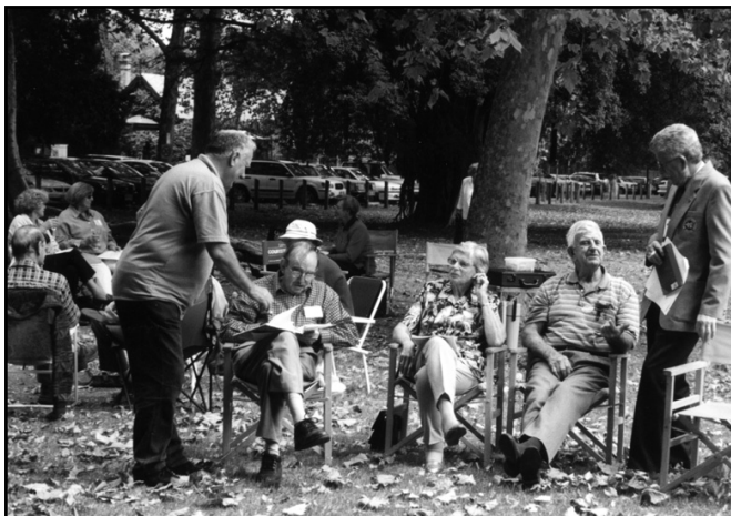
Old scholars enjoying the occasion at the Annual Picnic at Botanic Park on April 3.